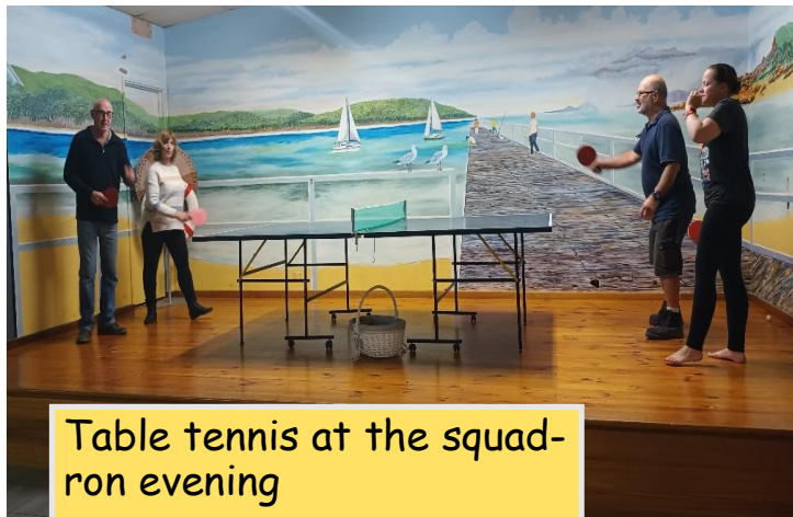
Table tennis at the squadron evening