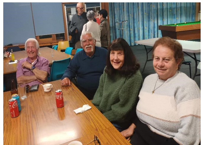
A big thankyou to the chefs